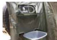
Integrated Shower Unit