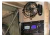
Electronics Panel with 12V Fan