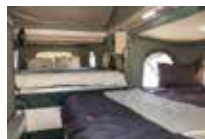
Upto five birth bedding