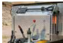
Aluminium Nose Cone Storage