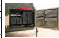
Wolfpack Box Storage