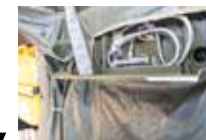
Shower & Hot/Cold Tap