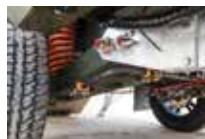
Independent Suspension System