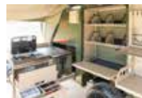
Slide Out Kitchen & Pantry